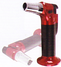
3. Put the butane torch down after 4-5 minutes, then to use