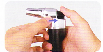
2. Push the button to lock direction, Keep burning, free your hands