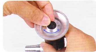
3. Rotate to adjust the flame size