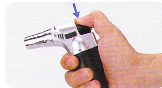
1. Press the button to ignite