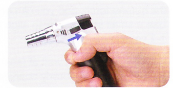
4. For safety, push the button towards lock direction to lock down the torch after use